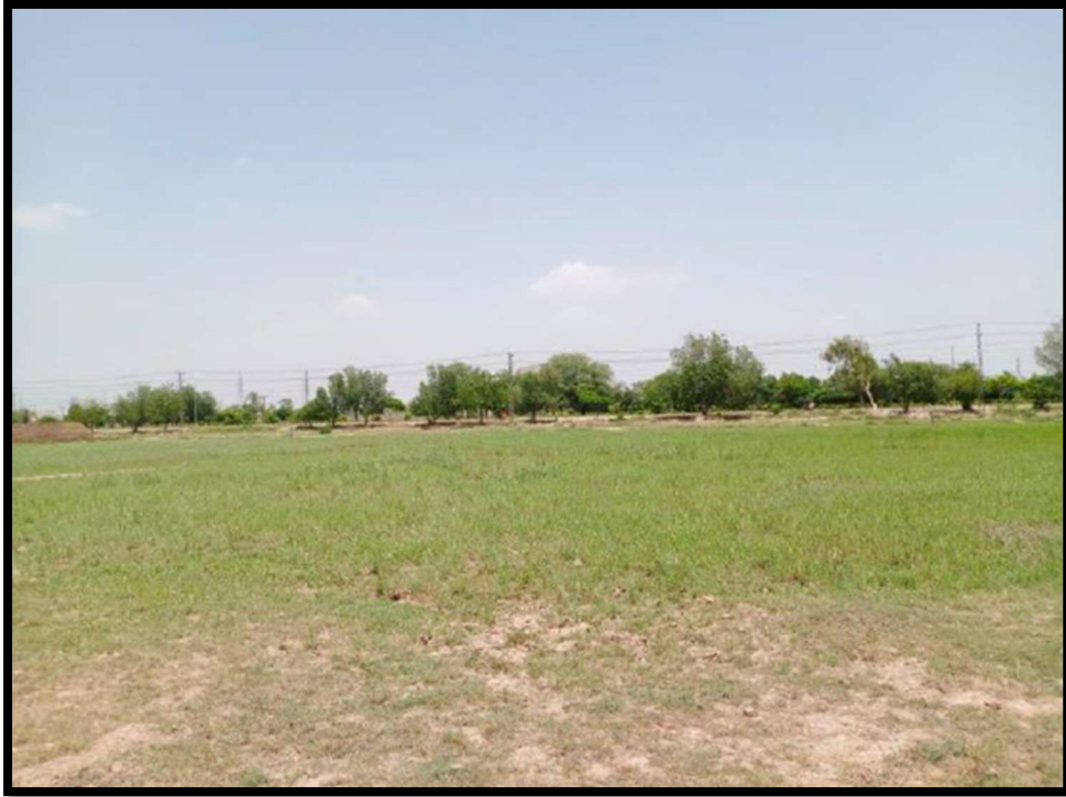
“Inside view of the property”