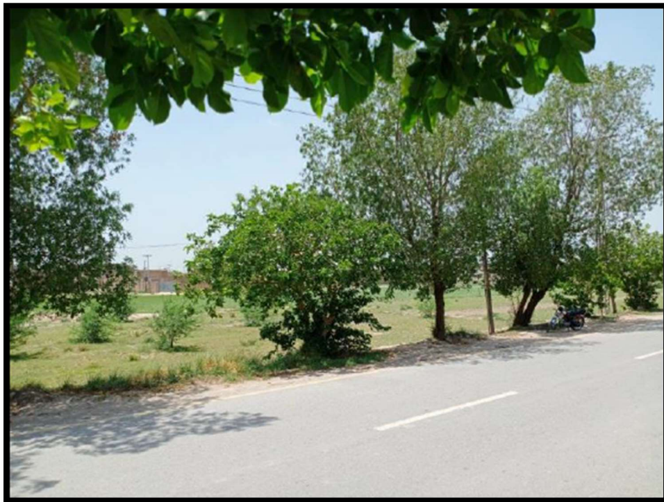
“Front view of the property”